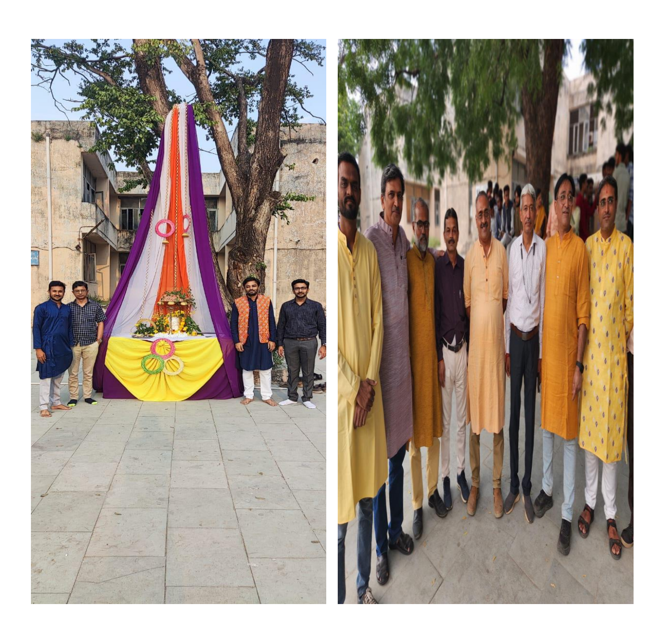
Principal sir and Institute faculties celebrating Navratri Festival